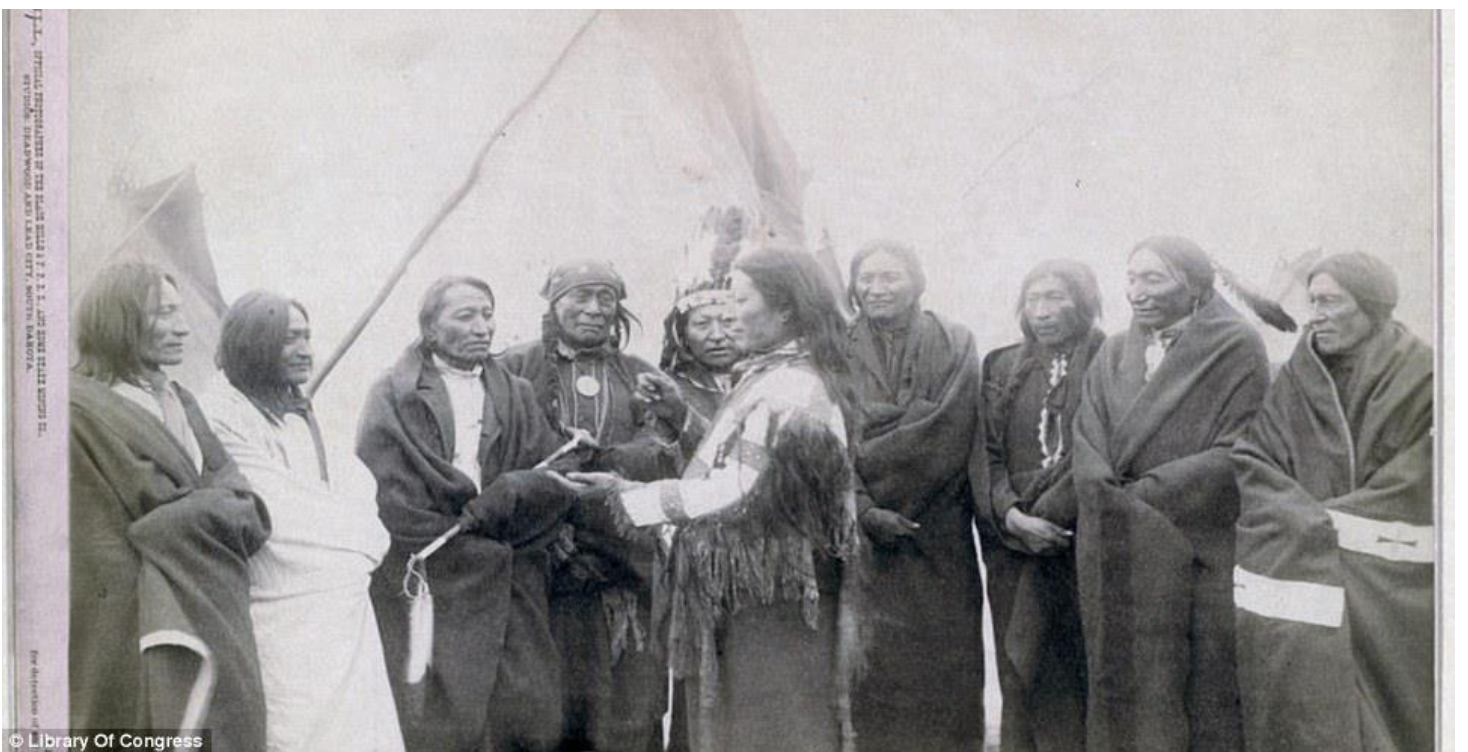
Peace council: The Indian chiefs who ended their war with the U.S. Army. Their names included Standing Bull, High Hawk, White Tail, Little Thunder and Lame