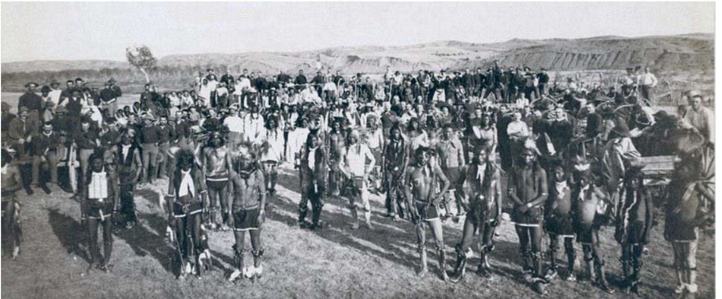
Braves: A portrait of a band of Big Foots (Miniconjou) at a Grass Dance on the Cheyenne River, watched by soldiers from the 8th U.S. Cavalry and 3rd Infantry