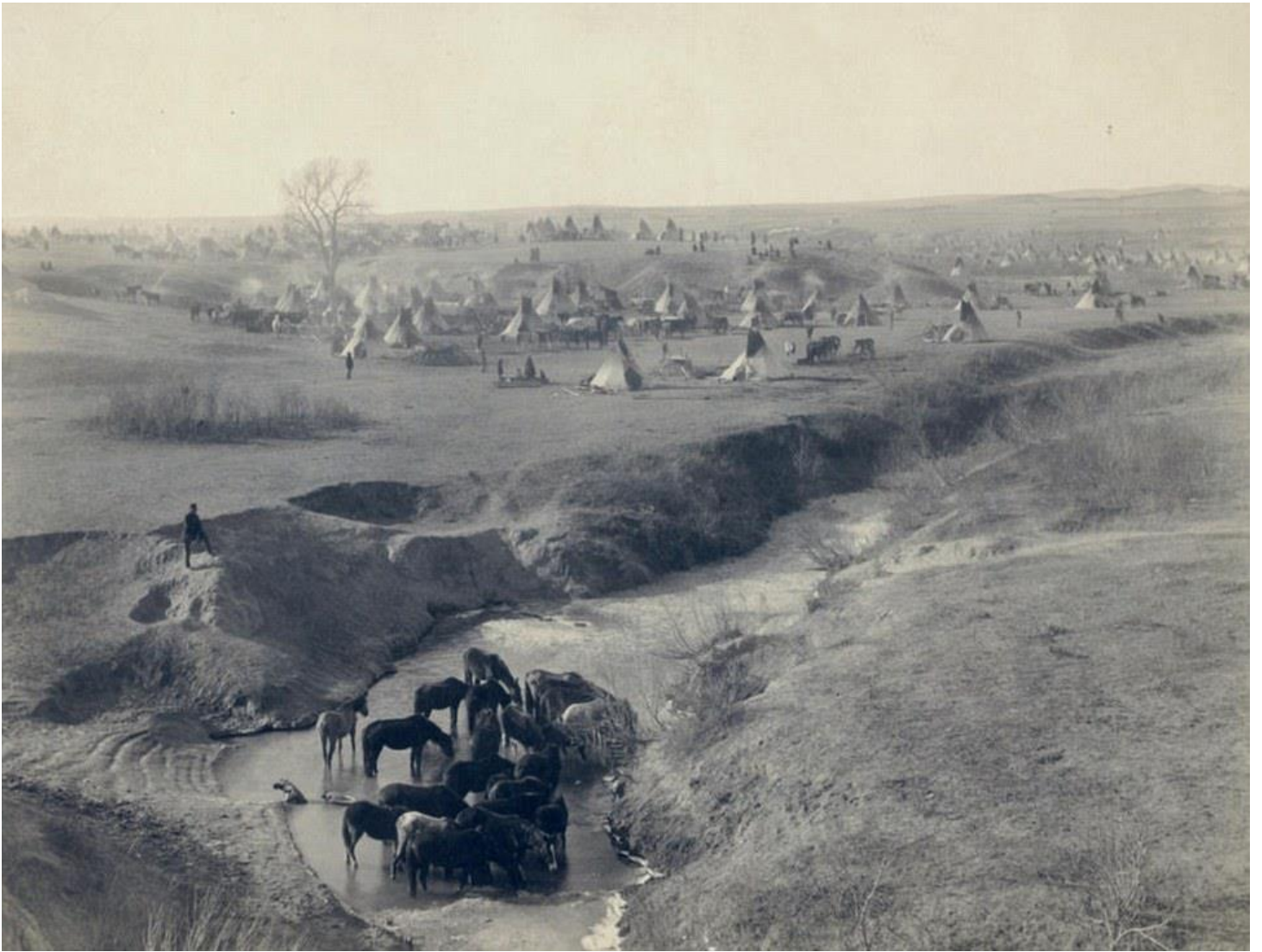
Indian camp: Titled Villa of Brule, this was the home of the Lakota (Sioux) tribe pictured in 1891 near the Pine Ridge reservation with the White Clay Creek watering hole