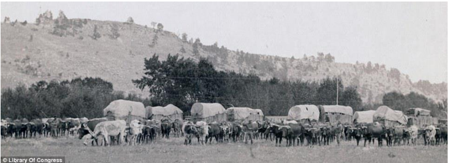
Wagon train: Oxen lead out the wagons in a photograph titled 'Freighting in the Black Hills' taken between Sturgis and Deadwood