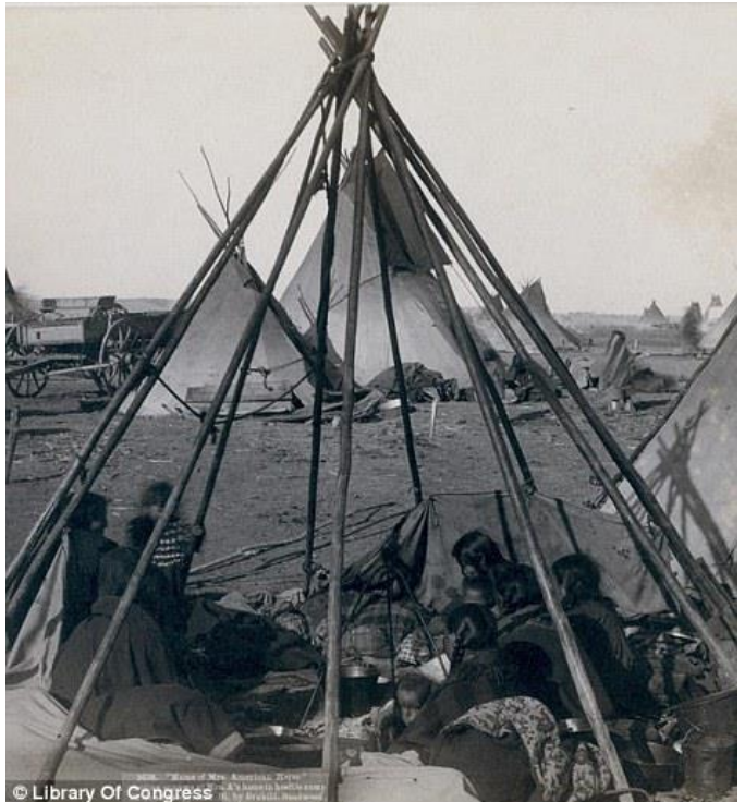
Two faces of the native American: Oglala chiefs Red Cloud in full headdress and American Horse wearing western clothing and gun-in-holster. Women and children seated inside an uncovered tipi frame in an encampment near Pine Ridge Reservation.