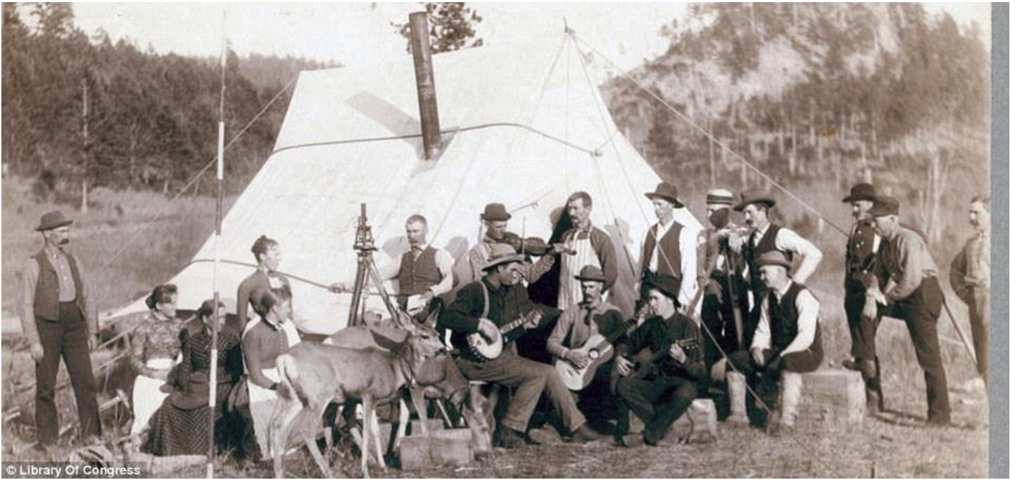
Happy band: Mining engineers with their wives and a couple of tame deer get together for an impromptu campside musical concert