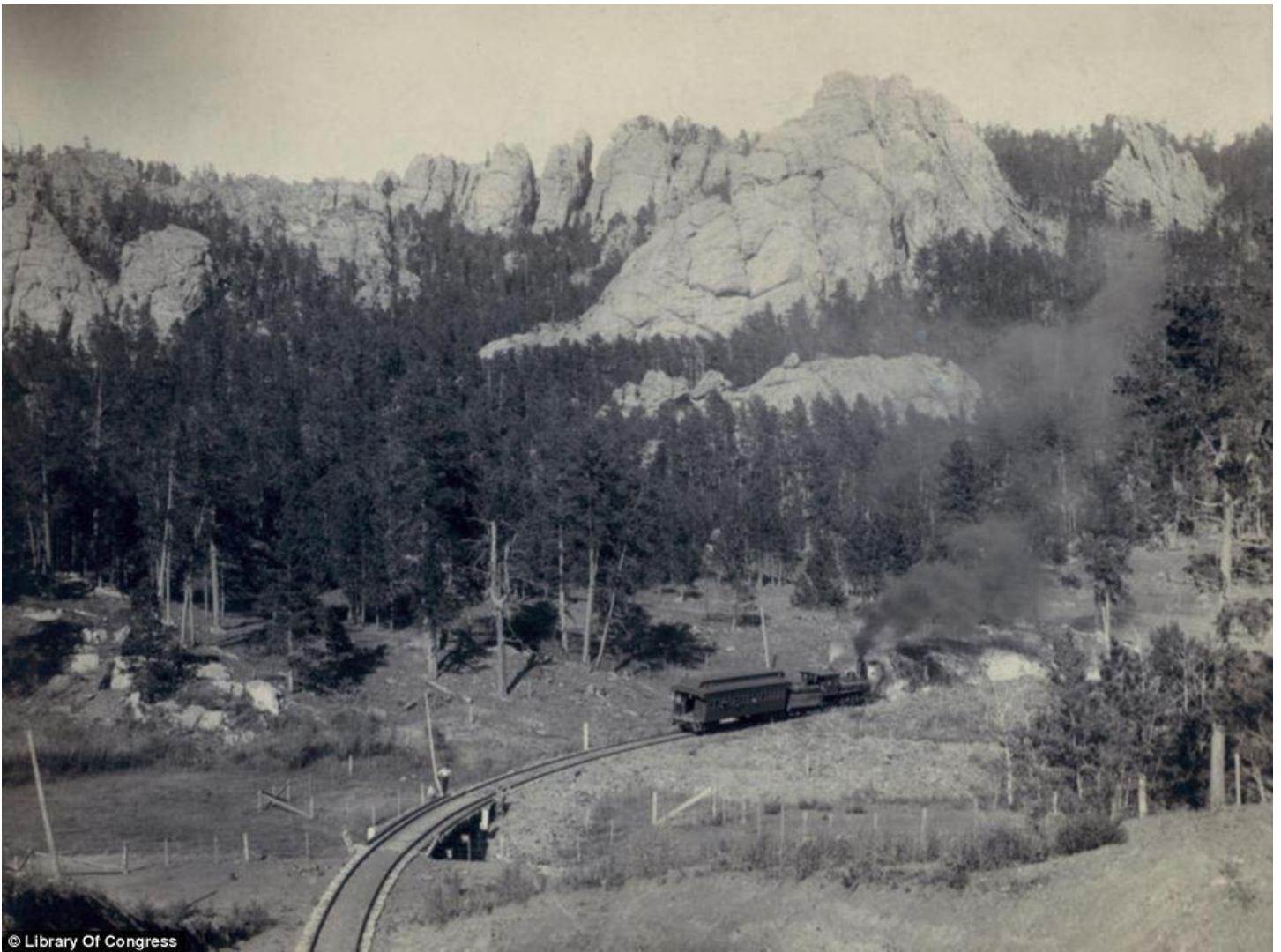
As the railroads went further west, so the settlers followed. Grabill's image Horse Shoe Curve in the shadow of the Buckhorn Mountains