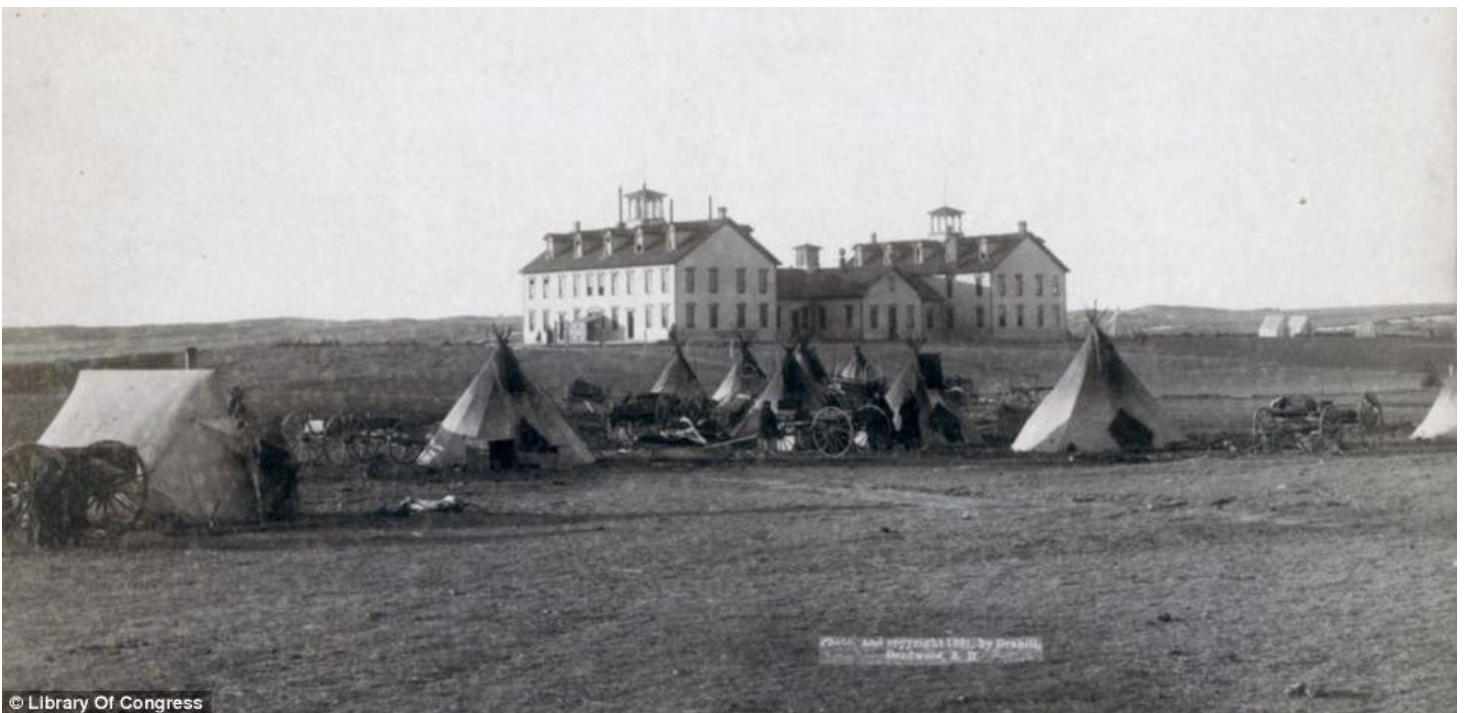
Living side-by-side: A school for Indians at Pine Ridge, South Dakota. There is a small Oglala tipi camp in front the large government school buildings