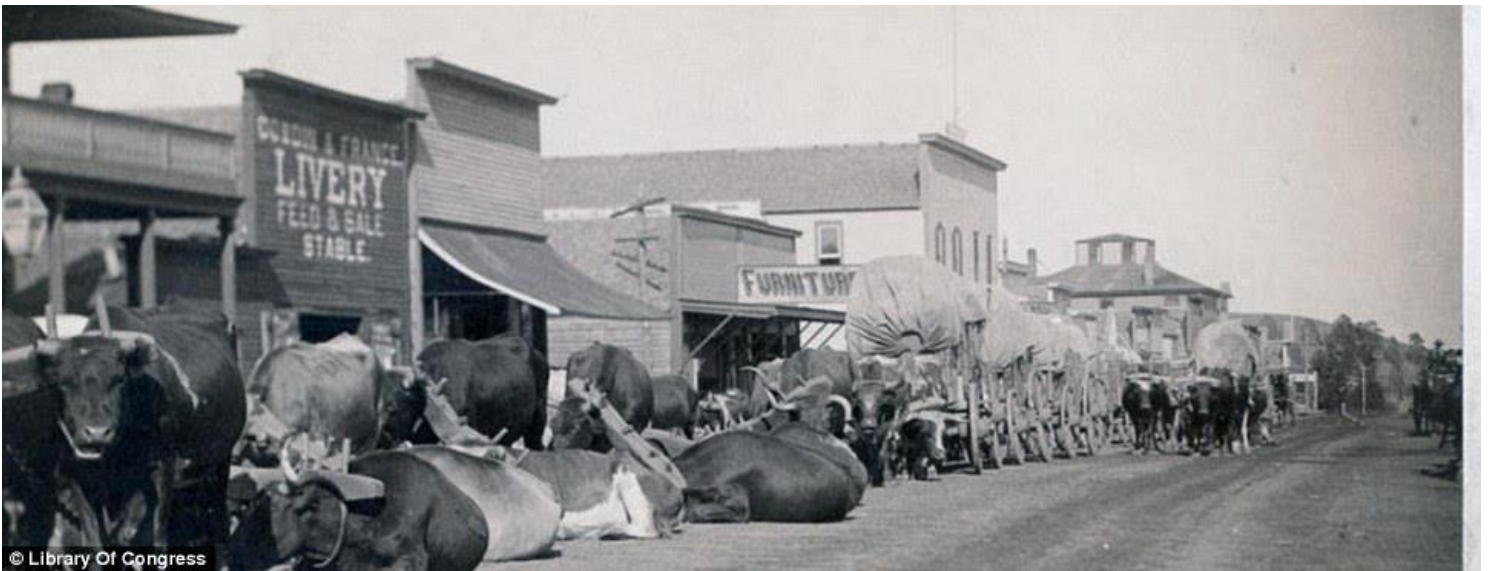
Ready to roll: A line of oxen and wagons along the main street in Sturgis in the Dakota Territory which was taken between 1887 and 1892